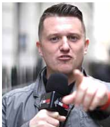
Tommy Robinson, an avowed fascist

We can't allow a party to get into government that would embolden those like Robinson, regardless of the fact that Farage