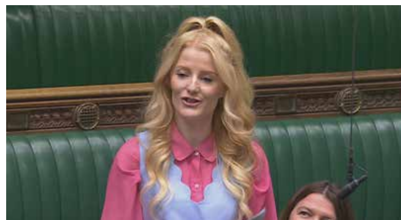
Hannah Spencer giving her maiden speech in Parliament

THE GORTON AND DENTON byelection in February won by Green Party candidate Hannah Spencer, who beat Reform UK's Matthew Goodwin by 12 percentage points, shows Reform can be beaten despite the unpopularity of the Starmer government and the Tories.