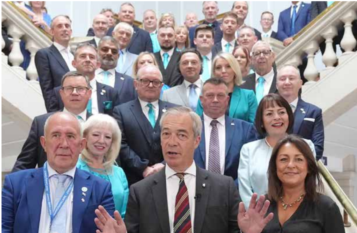
Having celebrated becoming Reform UK's 'flagship', Kent councillors are going down with their leader