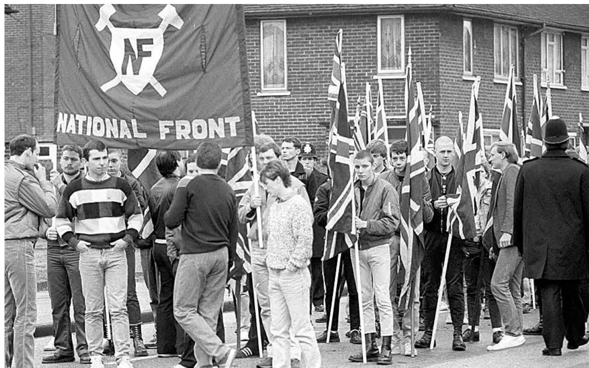
National Front demonstrations in the 1970's